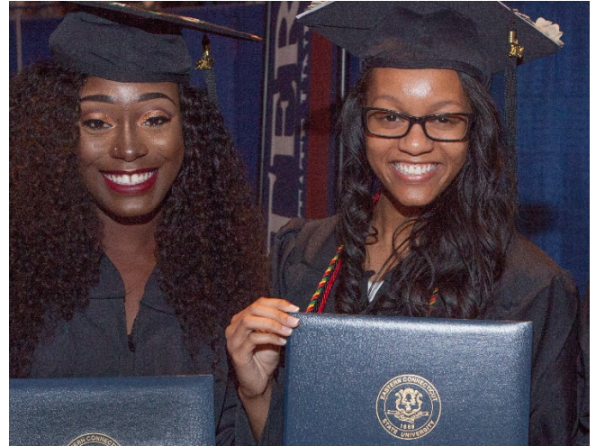
Eastern Connecticut State University

Using funds from a Title III grant, as well as other university resources, Eastern invested $4 million in the advising program. The year after the program was implemented, student satisfaction rose from 69 percent to 78 percent. NSSE data showed that from 2008 to 2012 student ratings increased 31 percentage points for faculty accessibility, 11 points for Eastern as a supportive campus, and 12 points for prompt feedback from faculty.