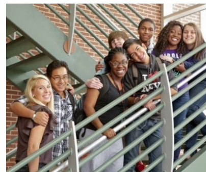
Middle Georgia State University

MGA’s QEP is designed to foster students’ progress through four tiers of experiential learning activities. Students are introduced to the QEP and experiential learning ideas at a “bronze level” event prior to their first experiential learning course or activity. They then have the opportunity to achieve “silver level,” “gold level,” or “platinum level” by completing additional qualified experiential learning courses and activities throughout their time at the university. MGA developed a rubric with specific evaluative criteria that allows them to qualify courses and activities as